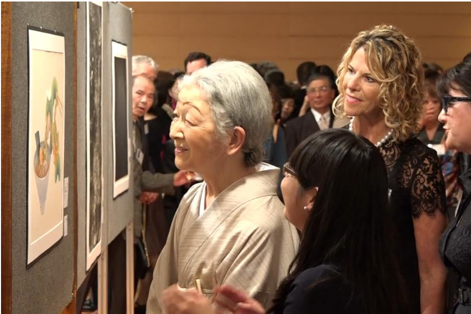
COLLEGE WOMEN'S ASSOCIATION OF JAPAN