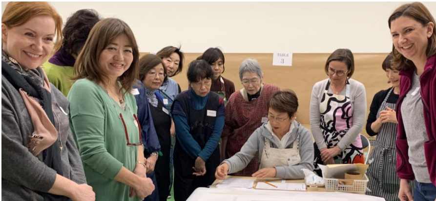
COLLEGE WOMEN'S ASSOCIATION OF JAPAN