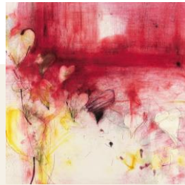
TSUJI Motoko Catalogue cover

HILLSIDE FORUM Tokyo 2022 10.19 Wed - 10.23 Sun 11:00 am - 6:00 pm final day 5:00 pm Open to the public Admission free